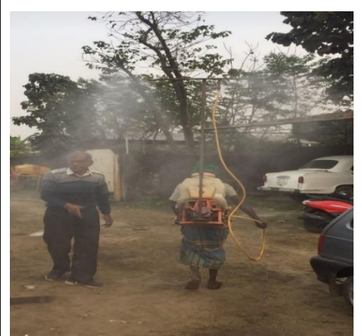
Modified boom sprayer-tractor operated and modified knapsack sprayer