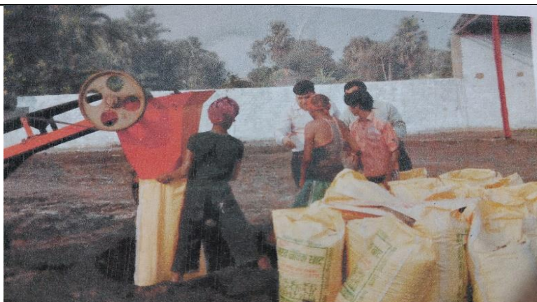
Modified tractor mounted aero tiller to use mixing of waste material for proper decomposition