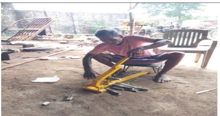
Modified electric power sugarcane bud cutter and hand sugarcane bud cutter