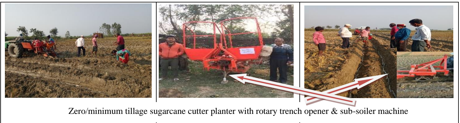
Zero/minimum tillage sugarcane cutter planter with rotary trench opener & sub-soiler machine