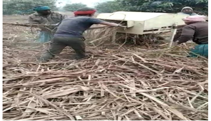
Modified sugarcane leaf destresser machine with 5 HP engine-suitable for slicing all types of sugarcane easily at low cost and in less time