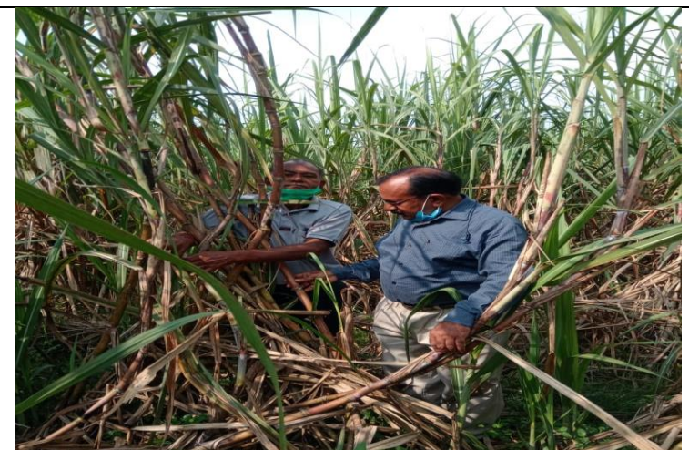
A view of sugarcane crop planted by zero/minimum tillage