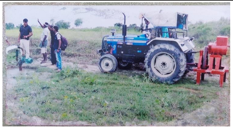
PTO. (Power Take-off) - tractor driven generator operate at a time 3-4 tube wells simultaneously for irrigation in the area of Gandak basin (within 1 kilometer radius)