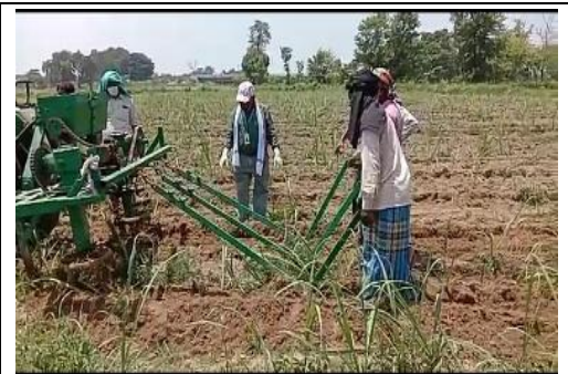
Weeding of sugarcane crop by modified power take off weeder- tractor operated in the presence of scientist of Krishi Vigyan Kendra, Narkatiaganj, West Champaran